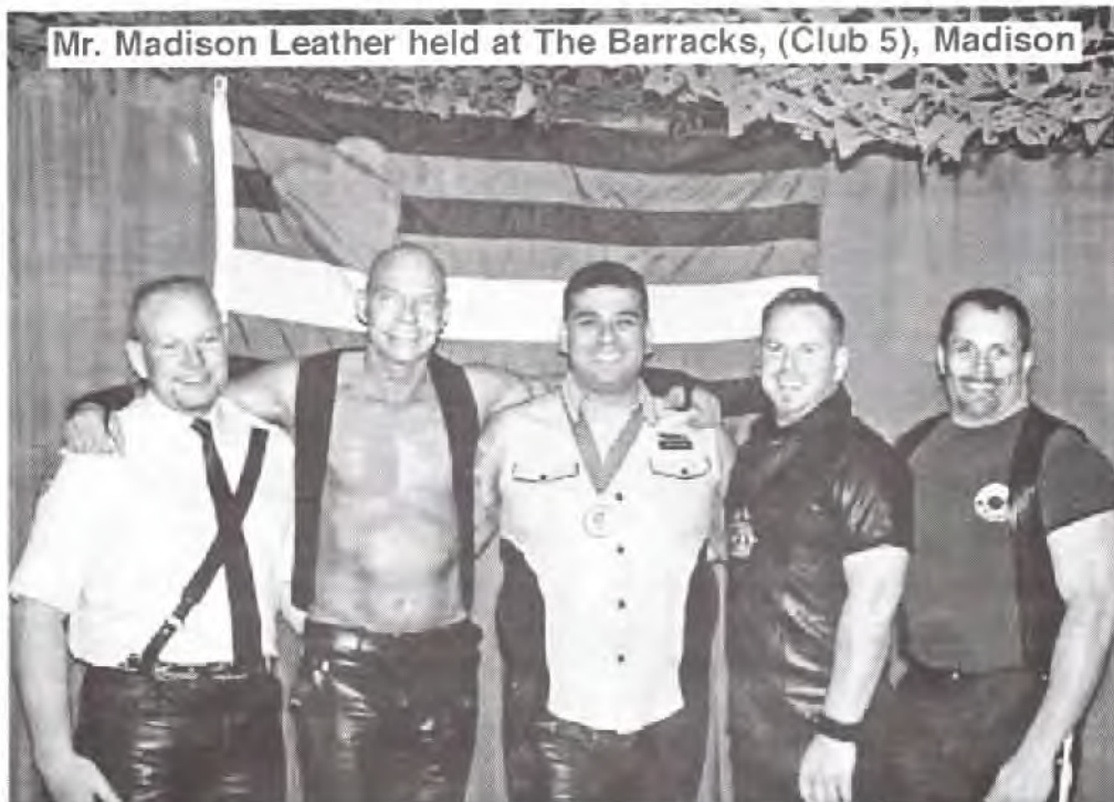
Mr. Madison Leather held at The Barracks, (Club 5), Madison

7219 W. Greenfield Ave. West Allis, WI (414)607-4068