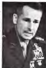
General Peter Pace

The highest-profile figure to say homosexuality is not immoral in the first news cycle following Pace's moral judgement? It was former Navy secretary, gay icon Liz Taylor ex-spouse and current Republican senator from Virginia John Warner, who told reporters March 13, "I respectfully but strongly disagree with the chairman's view that homosexuality is immoral."