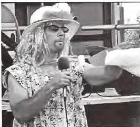
Charming, eccentric and a sharp tongue—such are the riches of Barbie's personality.