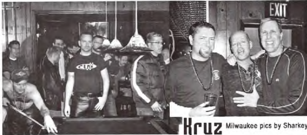
Kruz Milwaukee