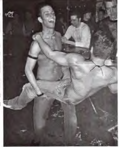
Green Bay Photos taken at Shelter, Napalese, XS Topsy's & SASS