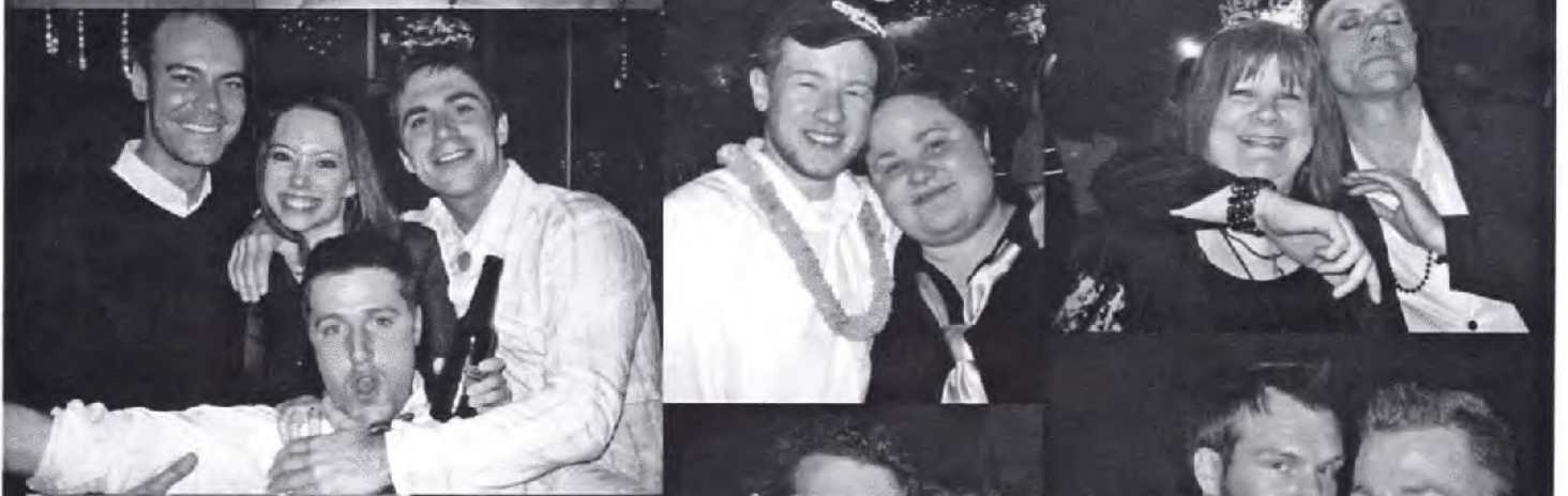
Club 5, New Year's Eve