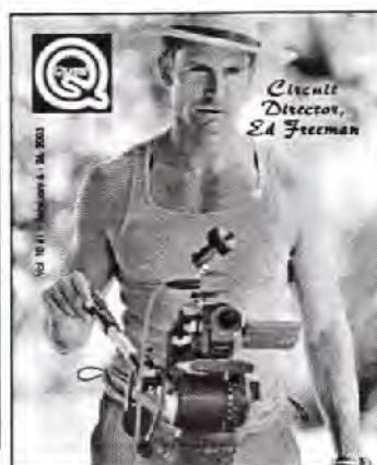
New press equipment allowed us to offer a full bleed image on our covers. Our cover for Volume 10 Issue 1

Back in 1996 in our third year, it took 8 hours to print a cover in color. We had to run the paper thru the press 5 times and had a lot of waste.