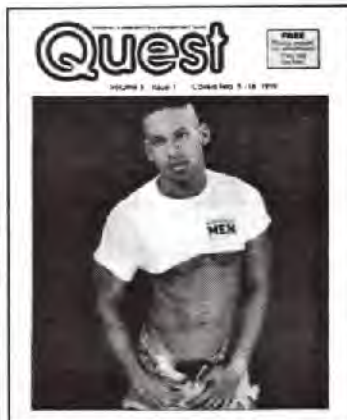
By year five we switched to a slightly larger size book. This is Volume 5 Issue 1