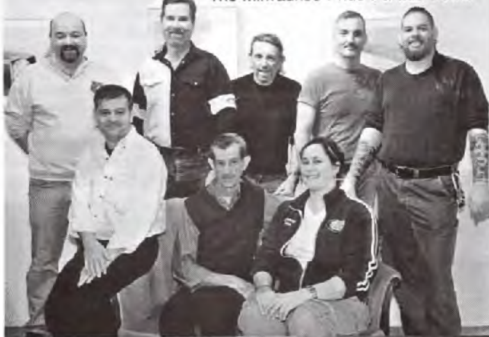
The Milwaukee Pride Parade Board