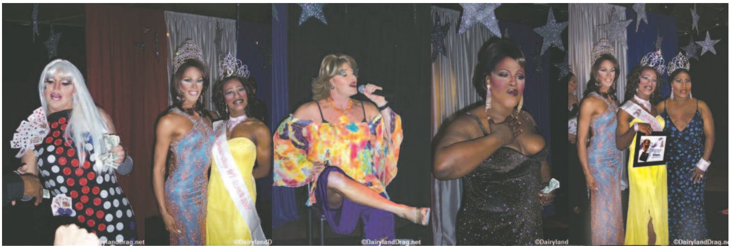
Three Strikes Productions Miss Brew City - USofA Pageant Held recently at MONA's