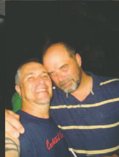
Za's 20th Anniversary Remembered at XS