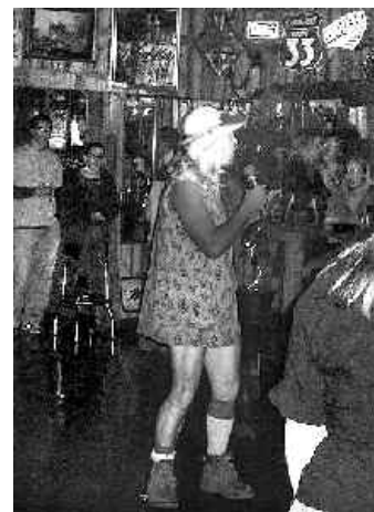
Born to shake people out of their complacency.