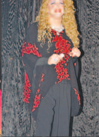
When Club ICON does Turnabout, they really know how to work that crowd! I haven't had this much fun in ages!